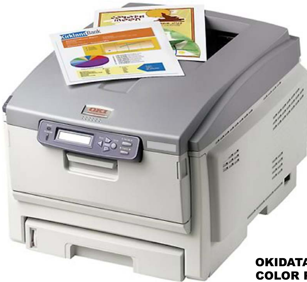
OKIDATA™ C5800 COLOR PRINTER