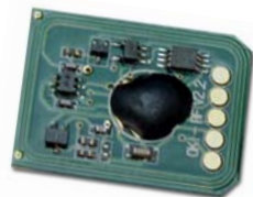
OKIDATA™ C5800 SMARTCHIP